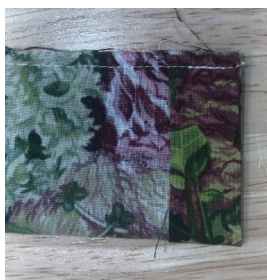
Fold one edge and sew