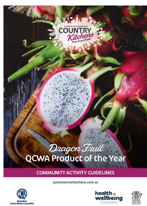
Dragon Fruit Community Activity Guidelines

To help you promote dragon fruit in your branch and community throughout 2023, Country Kitchens has launched four resources, including: (1) Dragon Fruit Community Activity Guidelines; (2) Dragon Fruit Flip Cards; (3) Dragon Fruit Poster; and (4) Dragon Fruit Recipe Booklet.