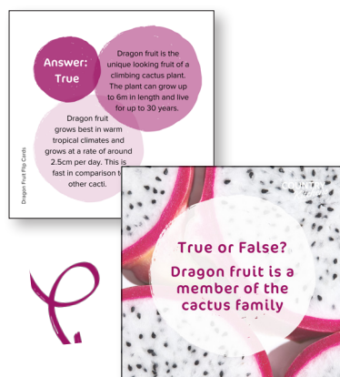
Dragon Fruit Flip Cards