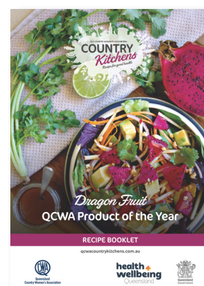
Dragon Fruit Recipe Booklet