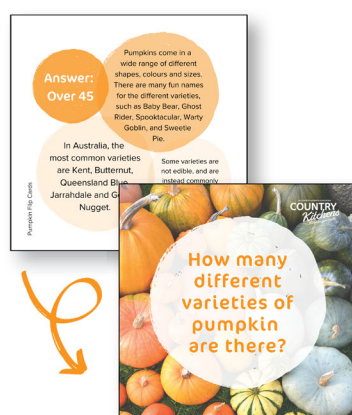
Pumpkin Flip Cards