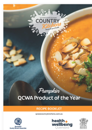
Pumpkin Recipe Booklet