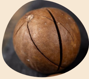
Hard, woody shell